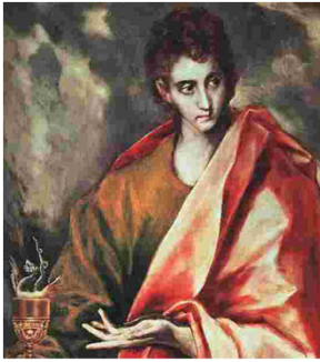
El Greco, "Apostle St John the Evangelist," 1610-14