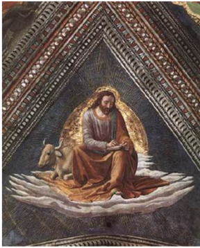
Cappella Tornabuoni, "St. Luke the Evangelist," 1486-90