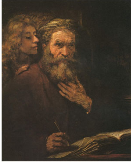
Rembrandt, "The Evangelist Matthew Inspired by an Angel"